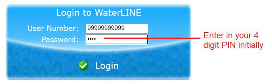
Forgot your Password?

1. Enter in your User Number and your 4 digit PIN