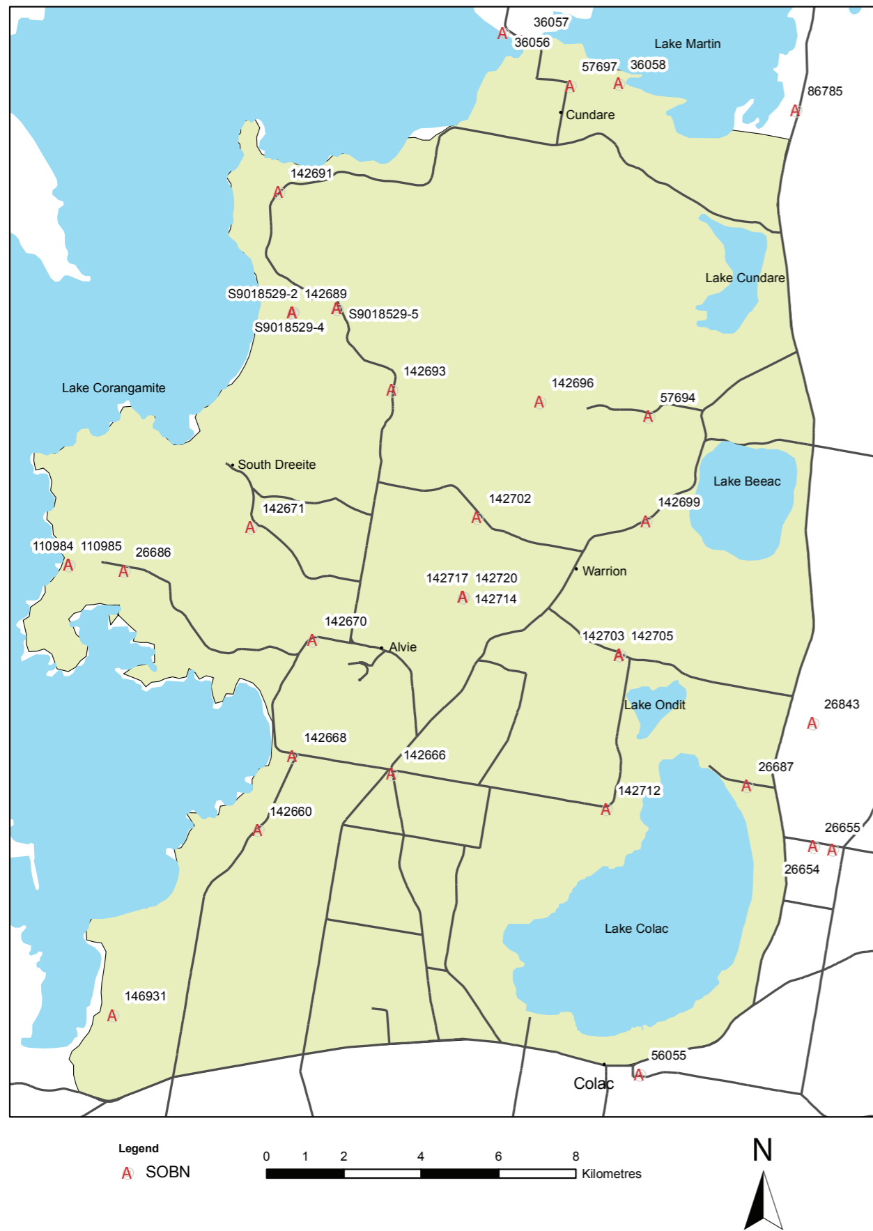
Figure 3 - Map of State Observation Bores in the Protection Area (June 2010)