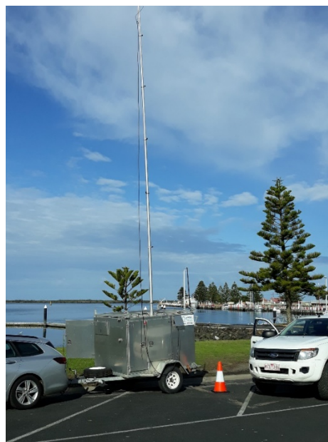
Pictured above: SRW crew signal testing in Port Albert, South Gippsland

When complete, the program will automate the meter reading of around 90% of all surface water and groundwater meters across our region.