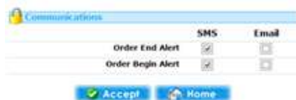
Opt in – with boxes flagged