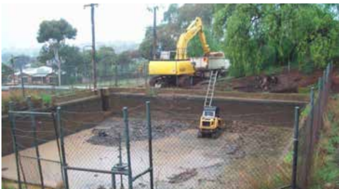
The Maddingley basin prior to connection to pump station in

Stage 2A involved the construction of a new water tank at Maddingley, replacing the old storage basin. The tank creates additional water pressure in the pipeline system enabling the upgrades to important sections of the pipeline network. The tank has been constructed and connections to the pipeline system and the pump station are complete and operational.