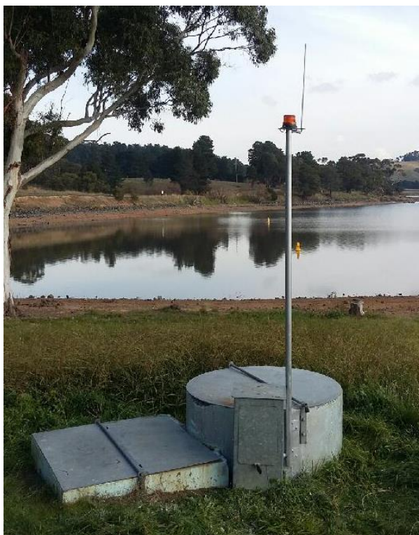
Figure 1. Modified pump well at Pykes Creek Reservoir